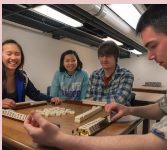
UW-Madison's International Learning Community